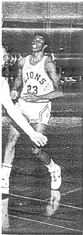
Westwood High attempt to... The Waco Lions won